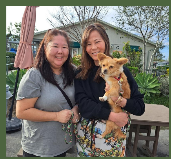
Acorn went from being a puppy stuck living outside in a yard, to being adopted into a very loving home where she would never be left out in the rain again.