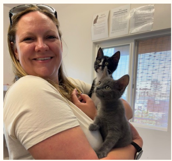
Kittens Namo and Namson found their home with a couple with 2 young children.