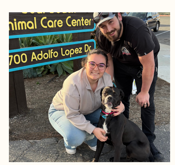
Onyx was surrendered to us through no fault of her own. It didn't take long for her to find a family looking to add her to their home.