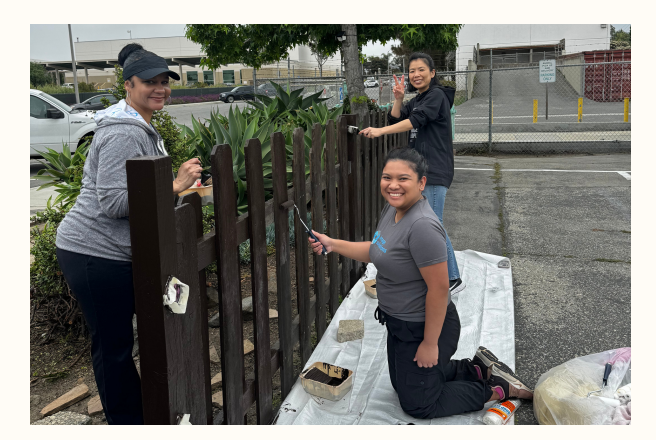
Image Solutions Gives Back team members volunteered their time painting, deep cleaning, weeding and organizing at the shelter. Financial contributions supported administrative and office upgrades.

Employees of Advertising Agency Saatchi and Saatchi assembled this donated Catio so that our cats can enjoy some fresh air and watch the world go by.