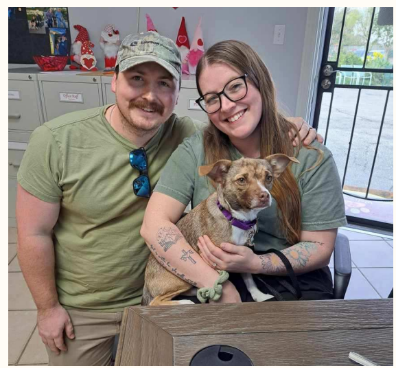
Mika was a shy dog, pulled from a larger shelter. She had time to decompress and learn that people aren't so scary! Now she has a home of her own.